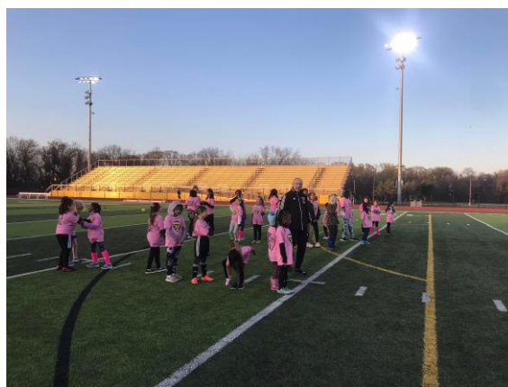
Girls Night at PHS Turf Field