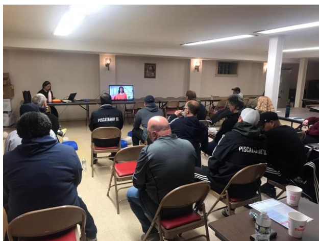
Travel Coaches taking CPR Trainings

NJ Youth Soccer has recently posted minimum coaching certification guidelines. US Youth Soccer provides specific educational certifications to coach different aged players. This supports the idea that youth players deserve to have experienced, licensed, quality coaches, educated with a player-centered philosophy. The PSC supports this guideline and will work with our coaches to obtain the proper certifications. For more information, click here .