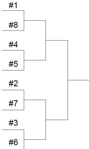
Eight team End-of-Season