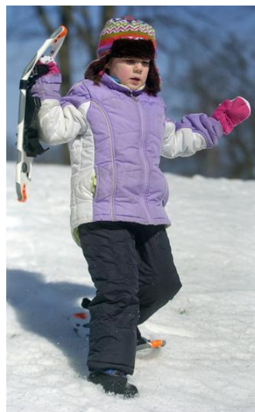
WINTER FESTIVAL – FEB 2013