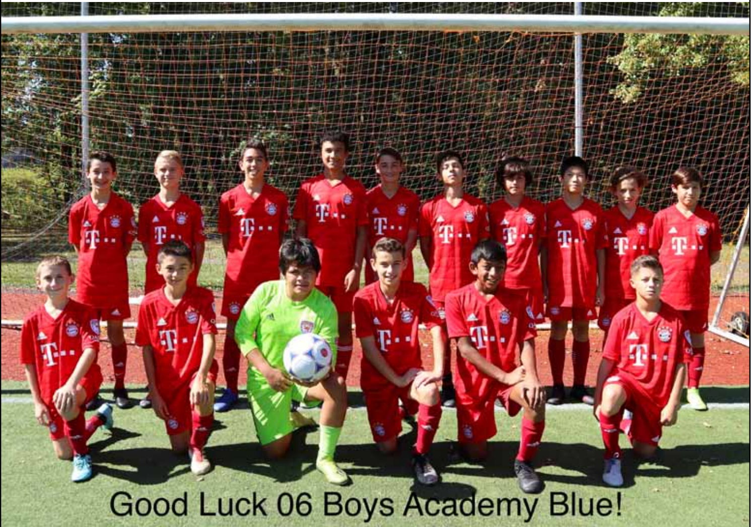
Good Luck 06 Boys Academy Blue!