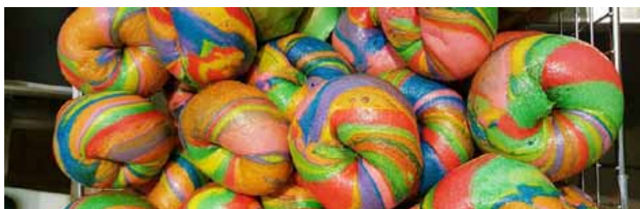
Bagels hand rolled, kettle boiled, and baked fresh everyday!