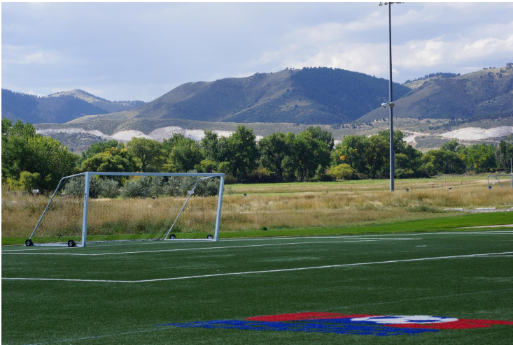
Long Lake Ranch