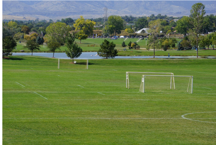
Stenger Soccer Complex