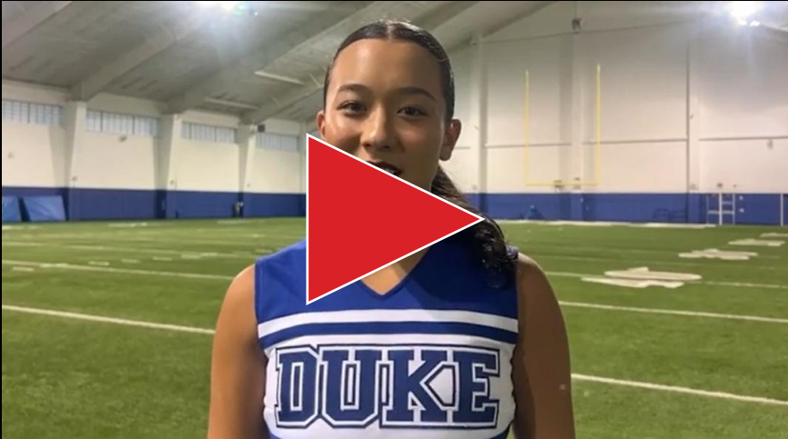
Be a Leader PSA