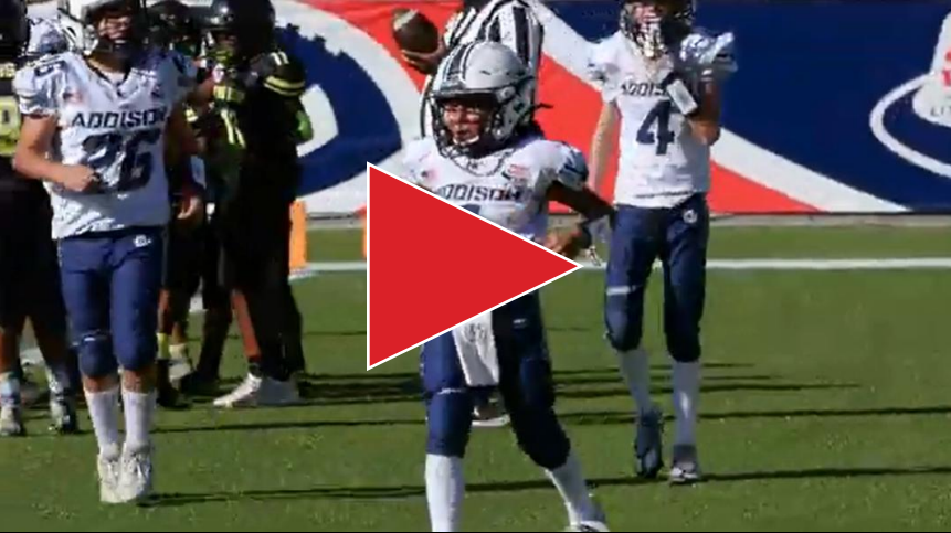
Leave It All On the Field