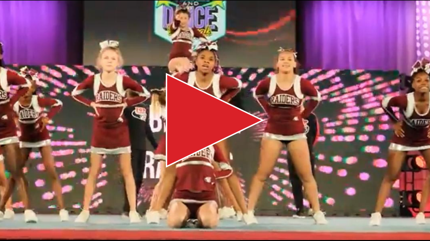
It Starts With You