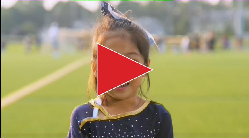
Be Better PSA